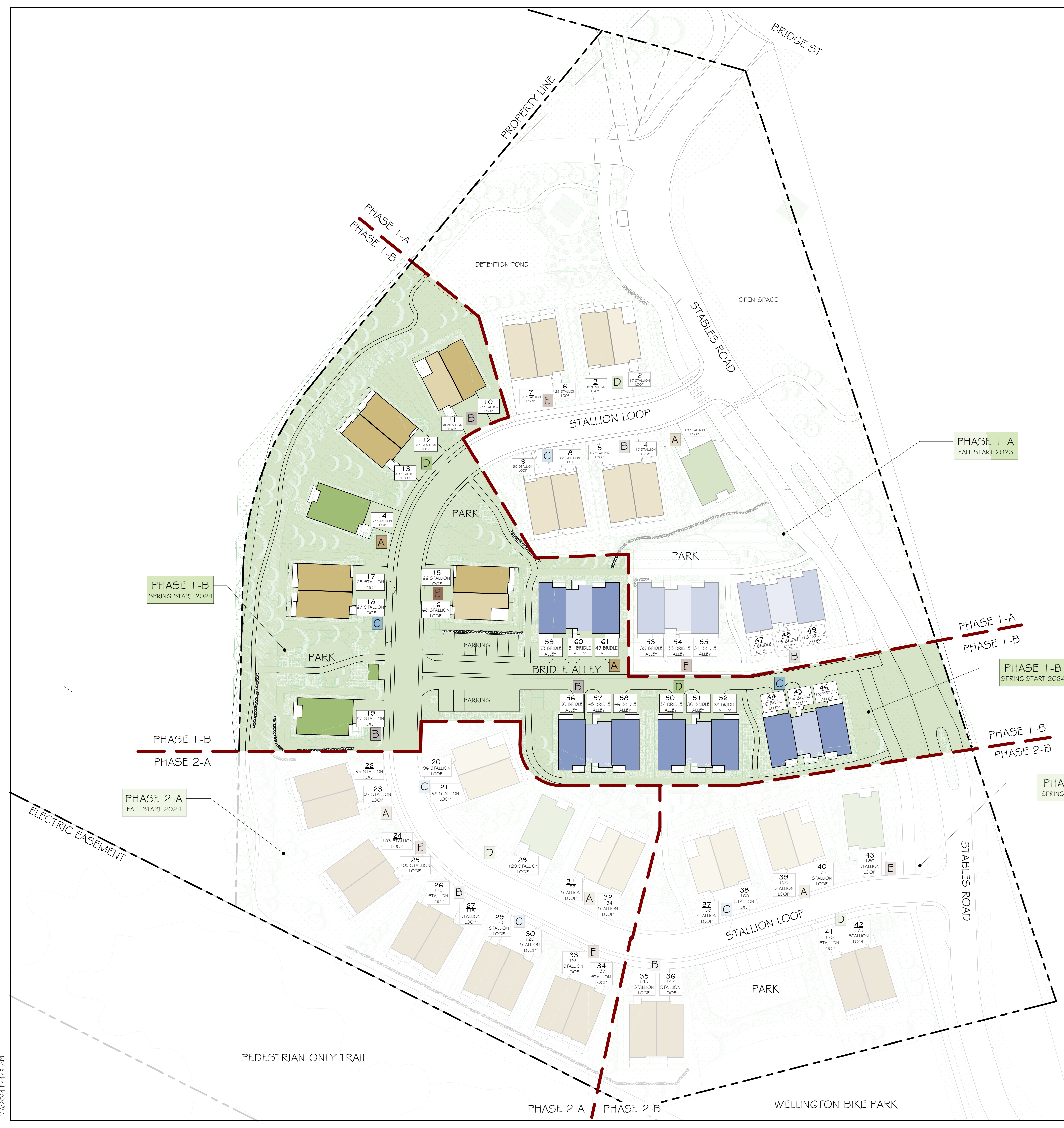
UNIT MODEL PLAN SCALE: 1" = 40'-0"